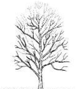
If the height of a tree must be reduced, all cuts should be made to strong laterals or to the parent limb. Do not cut limbs back to stubs.

Another possible cost of topped trees is potential liability. Topped trees are prone to breaking and can be hazardous. Because topping is considered an unacceptable pruning practice, any damage caused by branch failure of a topped tree may lead to a finding of negligence in a court of law.