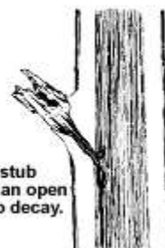
Leaving a stub maintains an open pathway to decay.