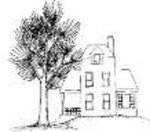
Trees that have been topped may become hazardous and are unsightly.

Without leaves (up to 6 months of the year in temperate climates), a topped tree appears disfigured and mutilated. With leaves, it is a dense ball of foliage, lacking its simple grace. A tree that has been topped can never fully regain its natural form.